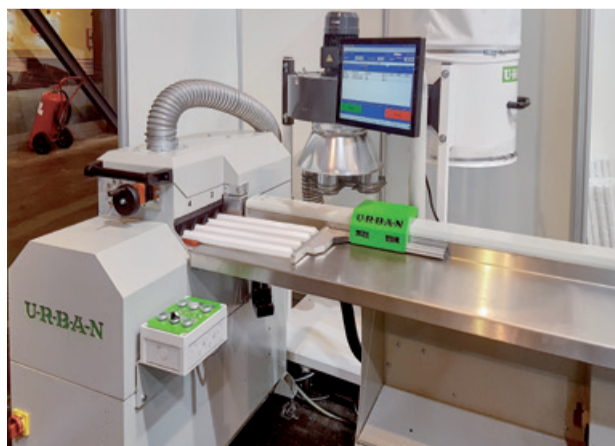
Four glazing beads in one single cut

Another advantage of Urban's novelty is the integrated window pane simulation ensuring that the pane which is inserted later on is already simulated during cutting. Controlled via PC and servo motor, the adjustment is done