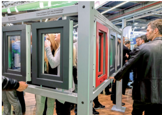
Nice corners are the benchmark

All the better that we can offer you a variety of new possibilities. It can be the new Vario-Cut-II welding