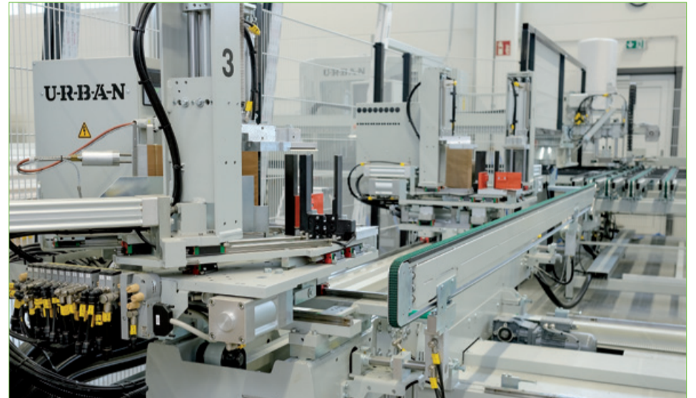
Urban know-how for JURA. AKS 6410 (top), SV 530 with turning station (bottom).