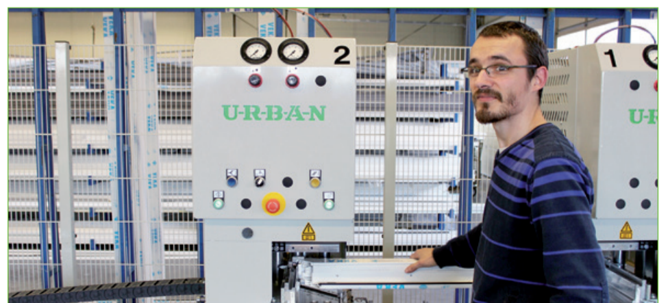
Welding with the AKS 3950 at Augustinuswerk e.V. in Lutherstadt Wittenberg.