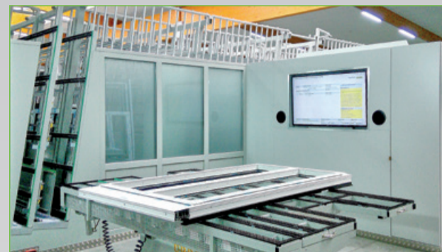
Well stored: Urban's storage for finished elements at Merschmann makes it possible.

blems in Merschmann's production. The same applies to door elements with threshold that also run through serial manufacture quite easily.