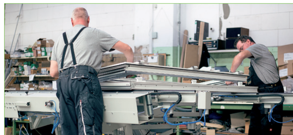
View into the window production at Hellraum in Lauchhammer.