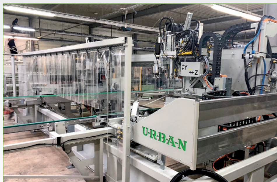
The new SV 840 by Urban in the production facility of Müllers Produktions GmbH

Contact: 08331/858-245 tobias.sontheimer@u-r-b-a-n.com